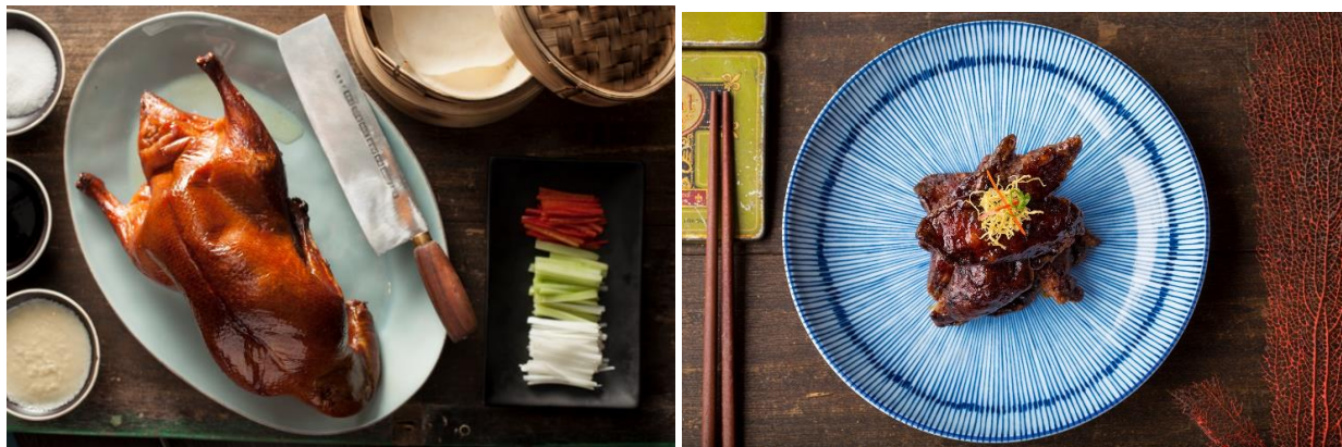
Savour Mott 32's award-winning cuisine, such as the (from L to R) Apple Wood Roasted Peking Duck with Mott 32's "Signature Cut" and the Signature Smoked Black Cod